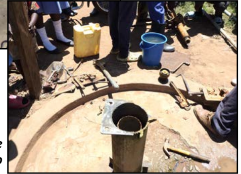
Right: Broken borehole pump