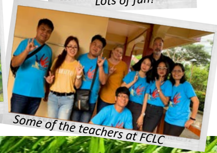
Some of the teachers at FCLC