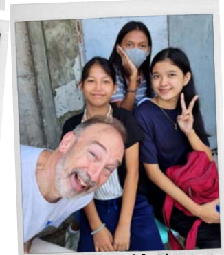
Lots of fun!