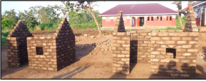
Above: Model Houses Right: Hairdressing