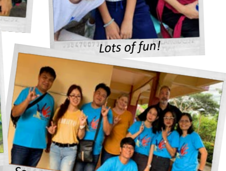
Some of the teachers at FCLC