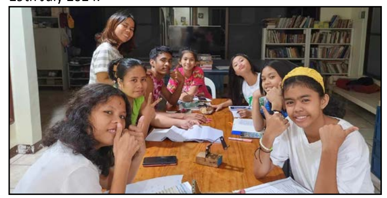
Bicol Deaf Action (Formerly Fishermen of Christ Learning Center)

Online learning will finish on May 31st 2024 when the 2023-2024 school year ends. This is very exciting as online learning has sometimes been difficult for the students. The students will return to school in person for the new academic year on 29th July 2024.