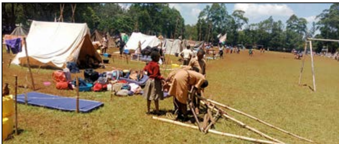
Students participating in scouts

With the support of DMI partners from Norway and Australia, the school has been re-painted and the latrine pits have been dug, built and painted. IICS managed to fix fifteen new doors