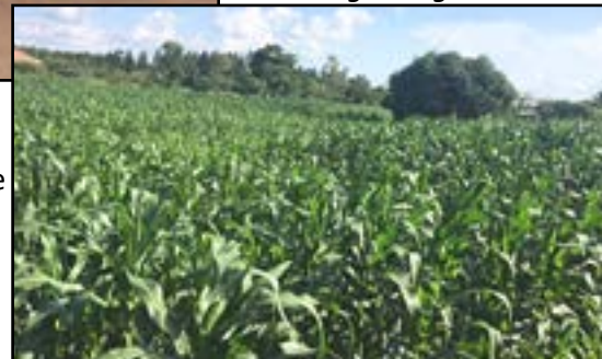
Maize growing at the school

The Neville Muir Comprehensive School has 202 Deaf and vulnerable students enrolled for Term 1. With 14 staff (both teaching and non-teaching), they are ready to learn new vocational skills to prepare them for employment. The large number of students is both a blessing and a challenge. The school still lacks enough food to feed all the students! Maize has been planted by the students but it won't be ready for harvest for another three months. We are seeking emergency food support to provide for the students and staff.