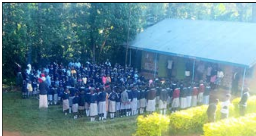
Left: School assembly

Their Secondary School building is still under construction. The ground floor has been completed and they are waiting for more funds to complete other storeys. There are 21 Deaf students at the Junior Secondary campus.