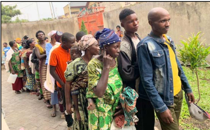
Waiting for food

The Deaf adults of DR Congo were able to receive small business loans to start enterprises which will help them gain self-sustainability. There are five loan groups, each comprised of 3-5 members, sharing USD9,500 in total. The first year of business is now complete and all loans (except for one group) have been repaid. This is outstanding. These members have now received a second loan to further their business.