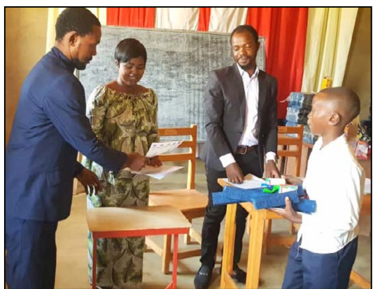
Student receiving gifts

Thanks to donations from DA supporters, the school was able to distribute soaps, notebooks, pens, rulers, mathematic toolboxes, biscuits, sweets, balloons, and palm oil to all the students. These were received with gladness. The school is providing ongoing training in sign language for the Beni Secondary School hearing teachers. This will help them to teach Deaf students more efficiently. We are looking at providing a safer and more efficient means for the children to get to school. Teachers and staff are currently using motorcycles to pick up the students. We are looking at providing a school bus to transport students who live far from the school.