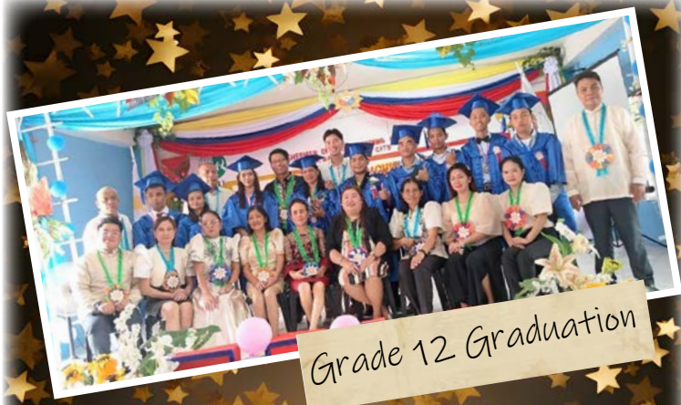
Grade 12 Graduation