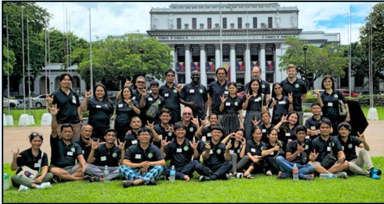
Fatherheart School leaders and attendees

The 'Fatherheart A' school is a week-long seminar which focuses on the love of God the Father. The love of the Father, forgiveness, healing and 'sonship' are central elements of the teaching. At the end of the week, attendees are encouraged to write letters to their parents asking for forgiveness. (Many Deaf in developing countries come from abusive homes. Healing starts by asking for forgiveness for one's own wrongs, not recalling hurts.)