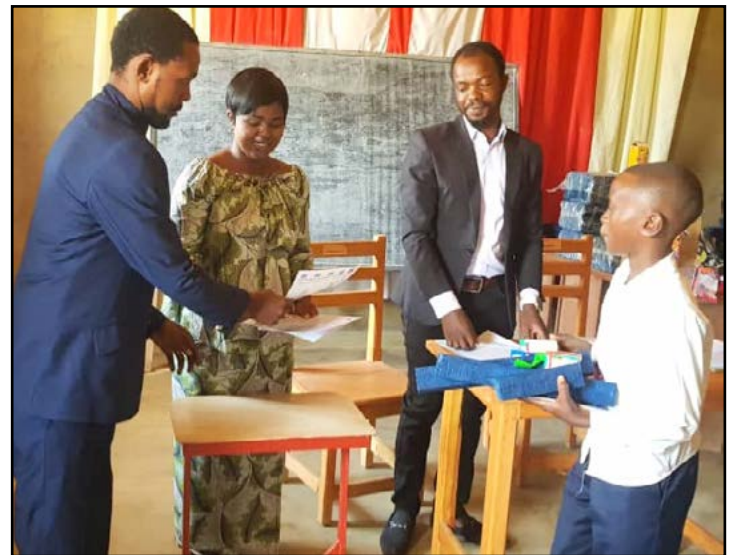
Student receiving gifts

Thanks to donations from DA supporters, the school was able to distribute soaps, notebooks, pens, rulers, mathematic toolboxes, biscuits, sweets, balloons, and palm oil to all the students. These were received with gladness. The school is providing ongoing training in sign language for the Beni Secondary School hearing teachers. This will help them to teach Deaf students more efficiently. We are looking at providing a safer and more efficient means for the children to get to school. Teachers and staff are currently using motorcycles to pick up the students. We are looking at providing a school bus to transport students who live far from the school.