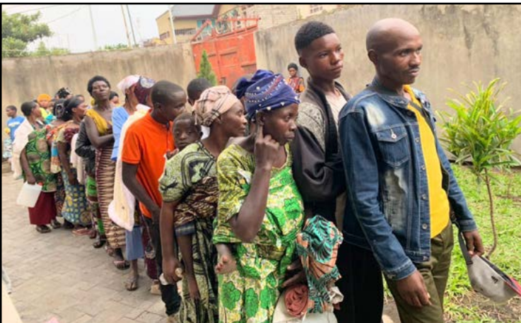
Waiting for food

The Deaf adults of DR Congo were able to receive small business loans to start enterprises which will help them gain self-sustainability. There are five loan groups, each comprised of 3-5 members, sharing USD9,500 in total. The first year of business is now complete and all loans (except for one group) have been repaid. This is outstanding. These members have now received a second loan to further their business.