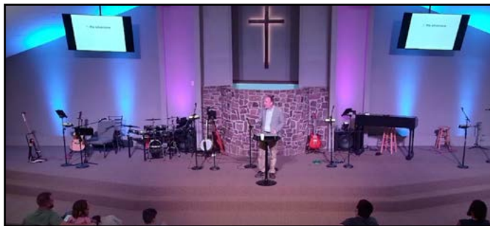
Four Winds Church

I was invited to give a pre-service DMI presentation to about 50 members of the church before giving a DMI-related sermon in the service to the full church. Four Winds Church has long been a generous supporter of DMI and church members dug deep to give individually as well. Then we all went out and ate catfish for lunch, the famous southern hospitality in full swing.