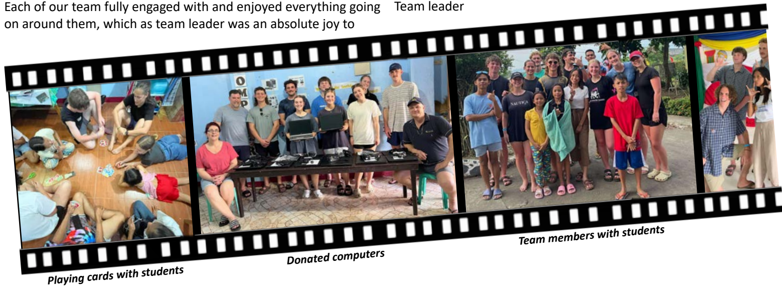
Playing cards with students