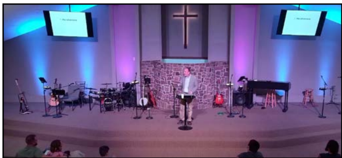
Four Winds Church

I was invited to give a pre-service DMI presentation to about 50 members of the church before giving a DMI-related sermon in the service to the full church. Four Winds Church has long been a generous supporter of DMI and church members dug deep to give individually as well. Then we all went out and ate catfish for lunch, the famous southern hospitality in full swing.