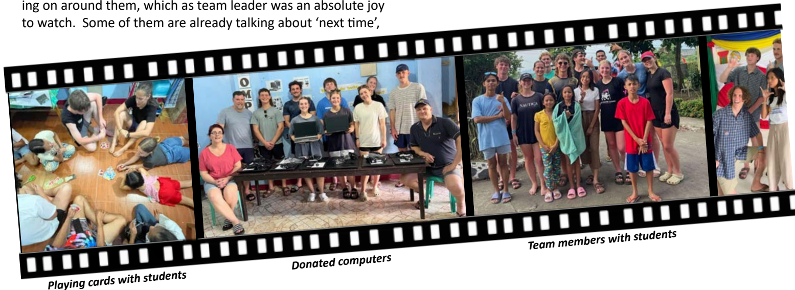
Playing cards with students