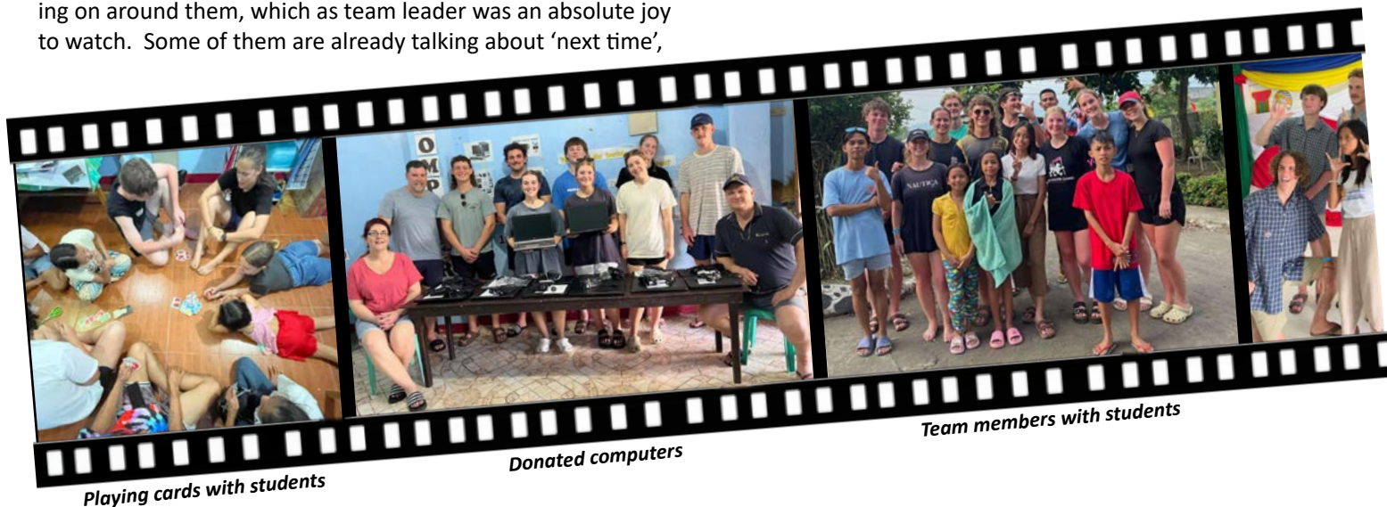
Playing cards with students