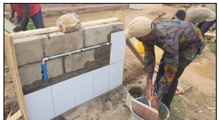
Building one of the water fountains