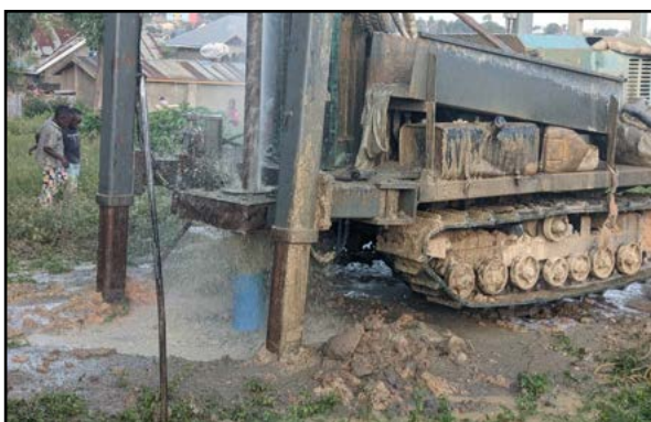
Drilling the borehole