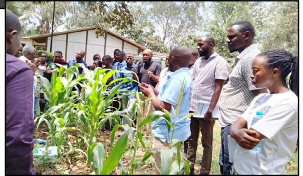
Hands on learning

Agriculture, Biogas production, and home animal husbandry. Participants also learned effective methods for creating kitchen gardens suitable for home use, producing farm manure, and strategies for selecting quality seeds for planting. Upon their return to their respective countries/regions, participants will train others in agricultural and livestock practices to raise funds for self-sustainability. Building knowledge and using that knowledge to help train others is a great asset in small businesses.