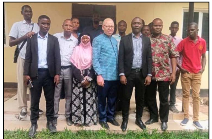
New church plant in Shinyanga

solid training program for students, evangelists and leaders. (See Training article on page *)