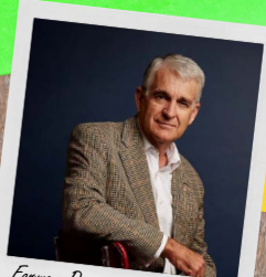
Former Deputy Prime Minister Hon John Anderson AC FTSE

Sydney trivia night at St Mark's Anglican Church, Northbridge