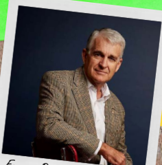
Former Deputy Prime Minister Hon John Anderson AC FTSE

Sydney trivia night at St Mark's Anglican Church, Northbridge