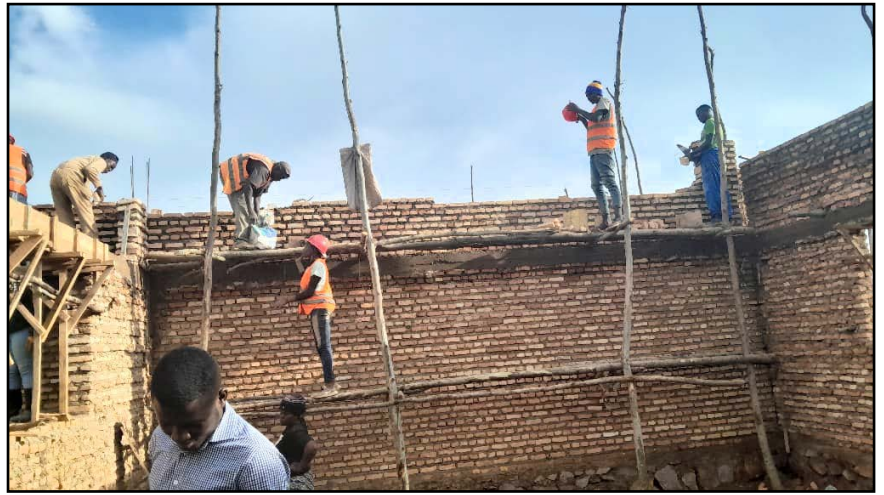
New Bible College construction