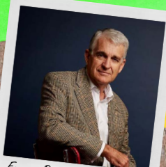
Former Deputy Prime Minister Hon John Anderson AC FTSE

Sydney trivia night at St Mark's Anglican Church, Northbridge