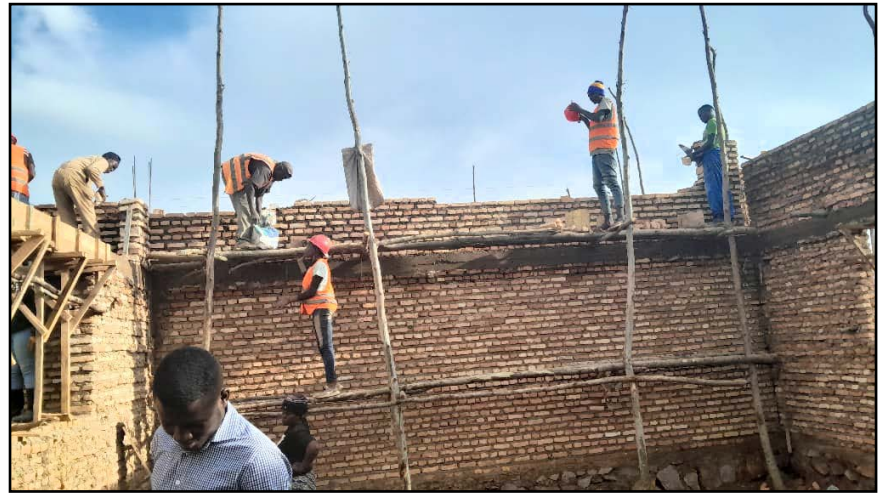
New Bible College construction