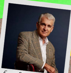
Former Deputy Prime Minister Hon John Anderson AC FTSE

Sydney trivia night at St Mark's Anglican Church, Northbridge