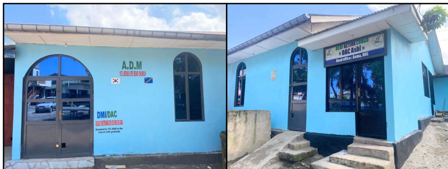
Rebuilt church in Goma