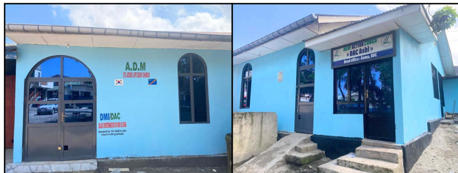
Rebuilt church in Goma