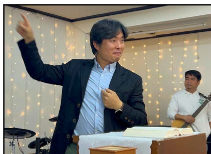
In Yeong preaching