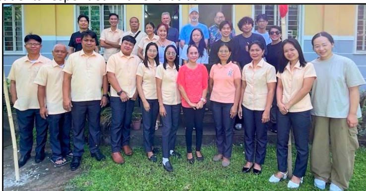
Garden Church mission team with BDA staff