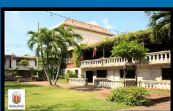
Casa Gorordo Museum