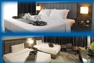
Double room options