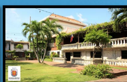
Casa Gorordo Museum