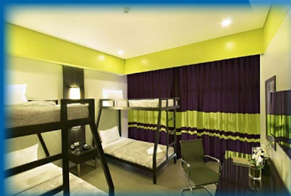
Dormitory style - shared bathrooms