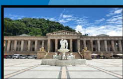
Temple of Leah