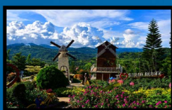
Sirao Flower Garden