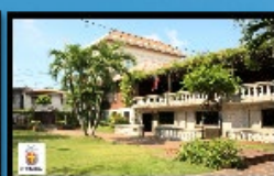
Casa Gorordo Museum