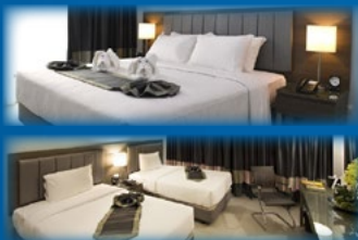
Double room options