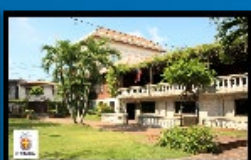
Casa Gorordo Museum