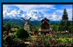
Sirao Flower Garden