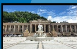
Temple of Leah