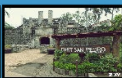
Fort San Pedro