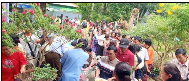
Yangon Church celebrating Christmas

we are grateful for the chance to share the Gospel with them.”