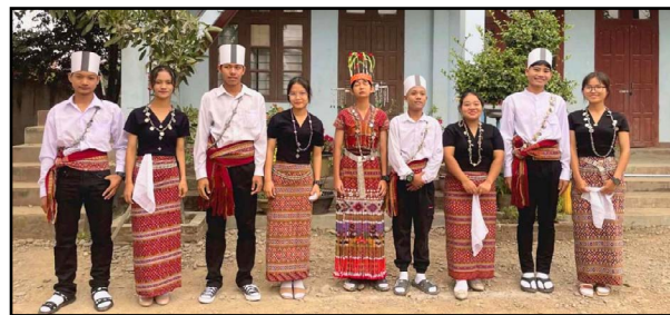
Dressed in tradition costume for Disability day

How pleased we are to report that the Muir School for the Deaf in Kalay is running well. In other areas of Kalay it's a battleground but our school has been operating under 'normal' conditions recently. Neither side has been fighting near the school and we are grateful for the peace the staff and students are enjoying.