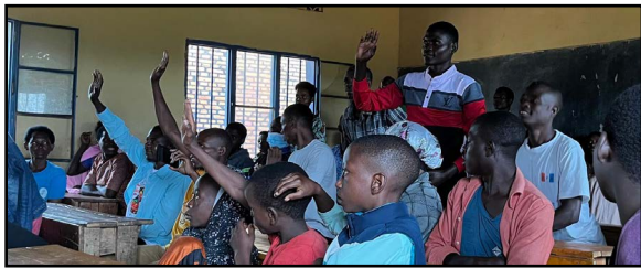
Hands up if you choose to receive Christ!