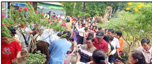
Yangon Church celebrating Christmas