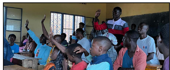
Hands up if you choose to receive Christ!