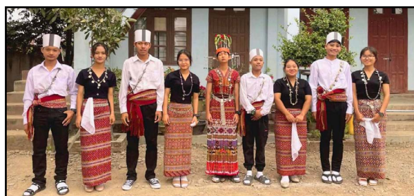
Dressed in tradition costume for Disability day

How pleased we are to report that the Muir School for the Deaf in Kalay is running well. In other areas of Kalay it's a battleground but our school has been operating under 'normal' conditions recently. Neither side has been fighting near the school and we are grateful for the peace the staff and students are enjoying.