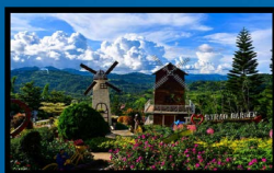
Sirao Flower Garden