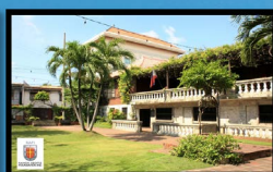
Casa Gorordo Museum